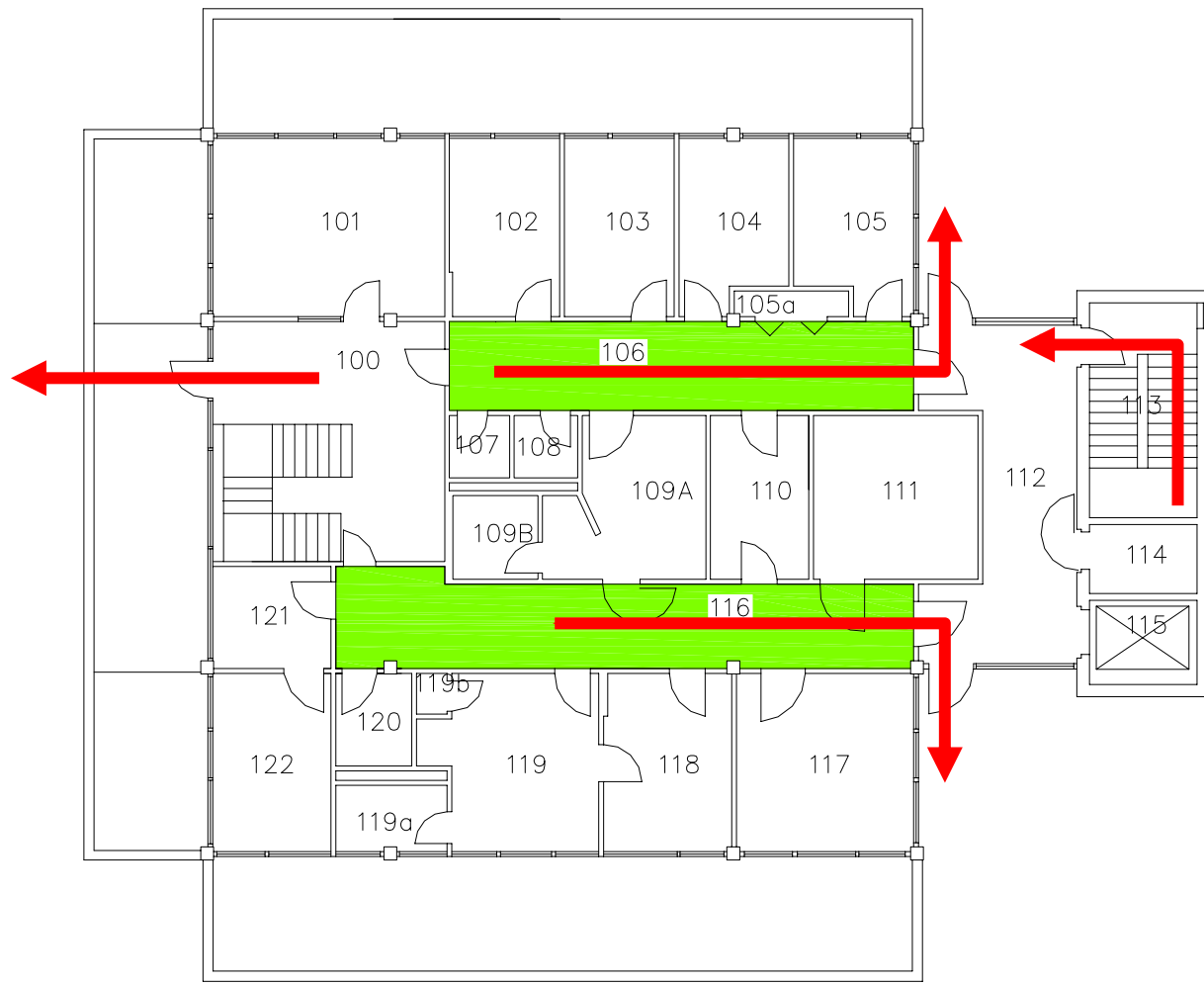
Betty White 1 st Floor

Evacuation Rally Point is the Front Lawn